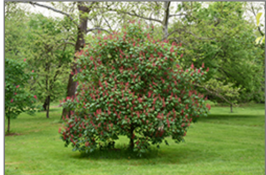
Splendens Red Buckeye in bloom