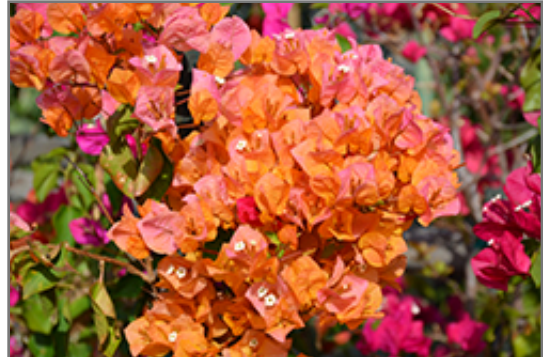
California Gold Bougainvillea flowers