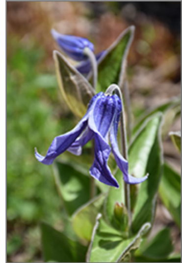
Blue Ribbons Bush Clematis flowers