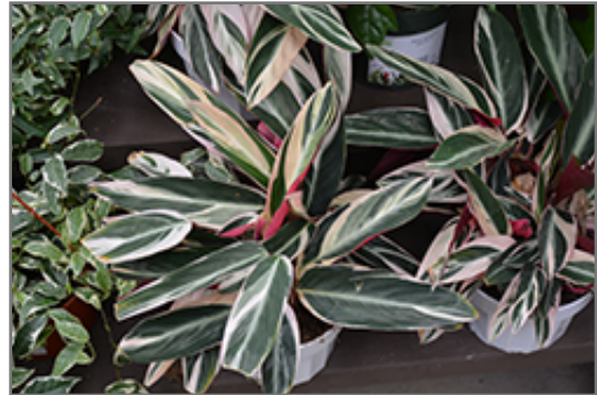
Triostar Stromanthe in full