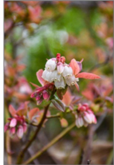
Blueberry Glaze Blueberry flowers

Blueberry Glaze Blueberry is a good choice for the edible garden, but it is also well-suited for use in outdoor pots and containers. It can be used either as 'filler' or as a 'thriller' in the 'spiller-thriller-filler' container combination, depending on the height and form of the other plants used in the container planting. It is even sizeable enough that it can be grown alone in a suitable container. Note that when grown in a container, it may not perform exactly as indicated on the tag - this is to be expected. Also note that when growing plants in outdoor containers and baskets, they may require more frequent waterings than they would in the yard or garden.