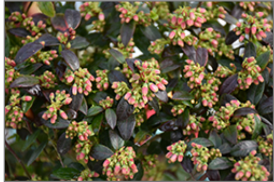
Blueberry Glaze Blueberry flowers

Blueberry Glaze Blueberry features dainty clusters of white bell-shaped flowers hanging below the branches in mid spring, which emerge from distinctive rose flower buds. It has dark green deciduous foliage. The glossy oval leaves turn outstanding shades of yellow, red and deep purple in the fall. It features an abundance of magnificent navy blue berries in mid summer.