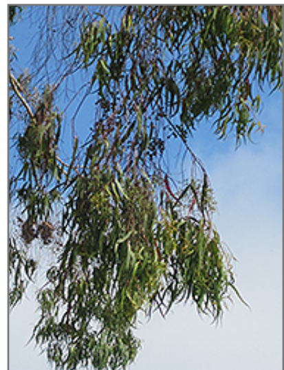
Lemon-scented Gum foliage