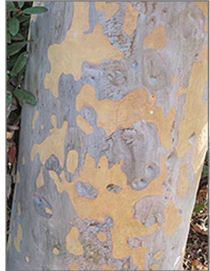
Lemon-scented Gum bark

This tree should only be grown in full sunlight. It prefers dry to average moisture levels with very well-drained soil, and will often die in standing water. It is particular about its soil conditions, with a strong preference for sandy, acidic soils, and is able to handle environmental salt. It is somewhat tolerant of urban pollution. This species is not originally from North America.