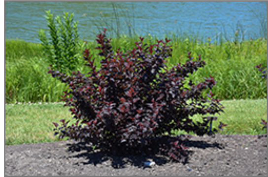
Fireside Ninebark

Fireside Ninebark is recommended for the following landscape applications;