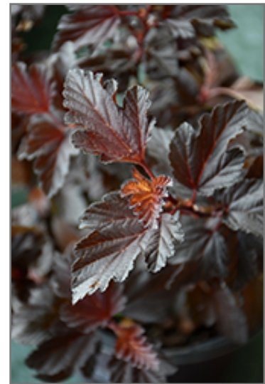
Fireside Ninebark flowers