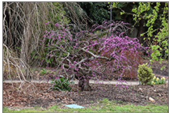
Traveller Weeping Redbud in bloom