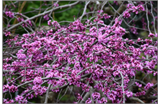
Traveller Weeping Redbud flowers