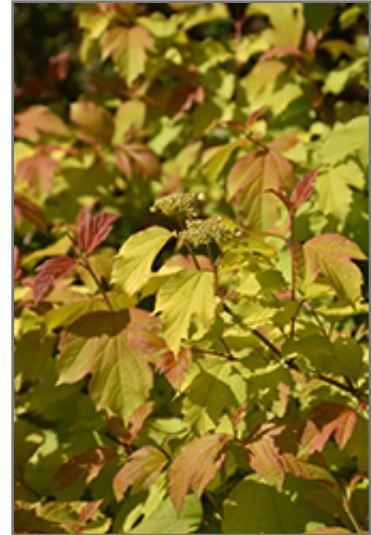
Oh Canada Cranberry Bush foliage

Oh Canada Cranberry Bush is recommended for the following landscape applications;