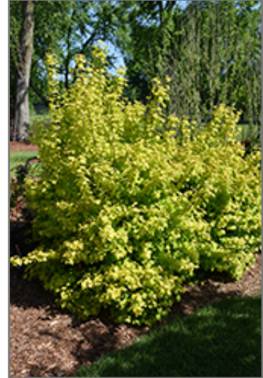
Oh Canada Cranberry Bush

This shrub does best in full sun to partial shade. It prefers to grow in average to moist conditions, and shouldn't be allowed to dry out. It is not particular as to soil type or pH. It is highly tolerant of urban pollution and will even thrive in inner city environments. This is a selected variety of a species not originally from North America.