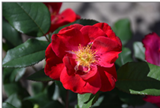
Top Gun Rose flowers