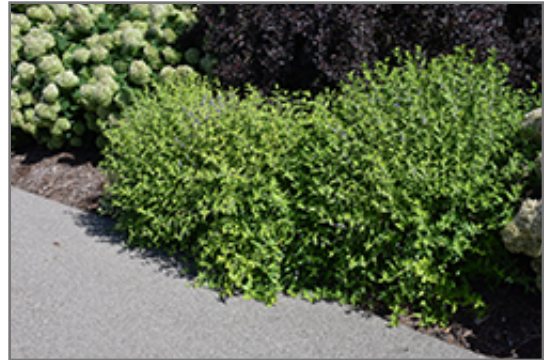
Sunshine Blue II Caryopteris in bloom