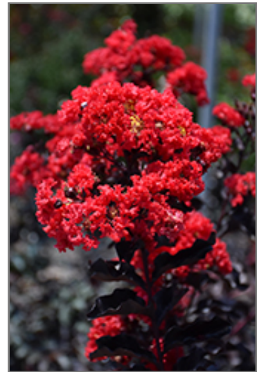
Black Diamond Best Red Crapemyrtle flowers