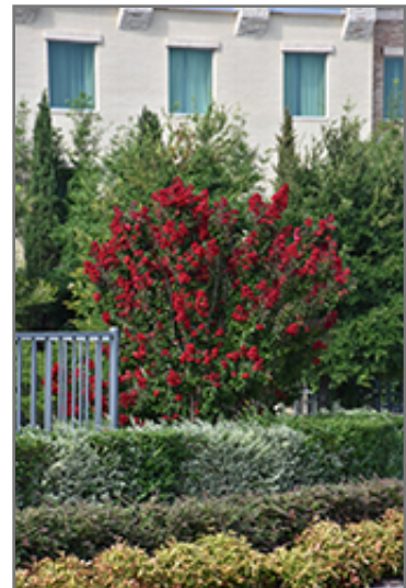
Double Dynamite Crapemyrtle in bloom