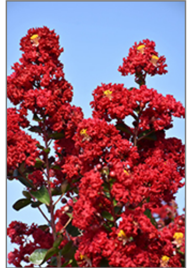
Double Dynamite Crapemyrtle flowers

This shrub does best in full sun to partial shade. It prefers to grow in average to moist conditions, and shouldn't be allowed to dry out. It is very fussy about its soil conditions and must have rich, acidic soils to ensure success, and is subject to chlorosis (yellowing) of the foliage in alkaline soils. It is highly tolerant of urban pollution and will even thrive in inner city environments. This is a selected variety of a species not originally from North America.