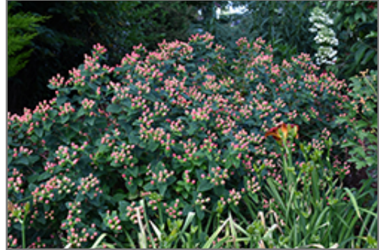
FloralBerry Rosé St. John's Wort fruit

FloralBerry Rosé St. John's Wort will grow to be about 3 feet tall at maturity, with a spread of 3 feet. It tends to fill out right to the ground and therefore doesn't necessarily require facer plants in front. It grows at a medium rate, and under ideal conditions can be expected to live for approximately 5 years. This is a self-pollinating variety, so it doesn't require a second plant nearby to set fruit.