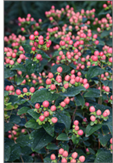
FloralBerry Rosé St. John's Wort fruit

FloralBerry Rosé St. John's Wort is recommended for the following landscape applications;