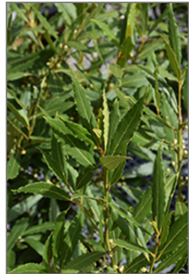
Emerald Wave Sweet Bay foliage