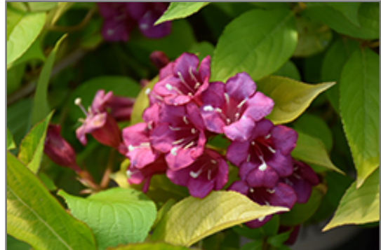
Golden Jackpot Weigela flowers

Golden Jackpot Weigela is recommended for the following landscape applications;