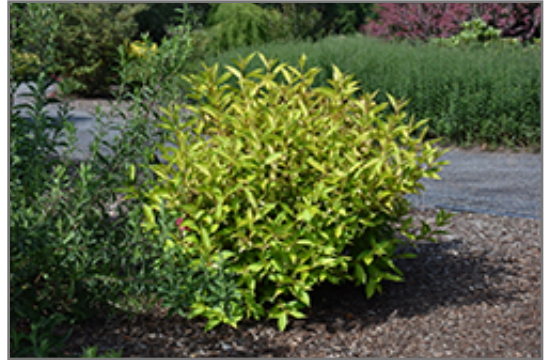
Golden Jackpot Weigela

Golden Jackpot Weigela makes a fine choice for the outdoor landscape, but it is also well-suited for use in outdoor pots and containers. Because of its height, it is often used as a 'thriller' in the 'spiller-thriller-filler' container combination; plant it near the center of the pot, surrounded by smaller plants and those that spill over the edges. It is even sizeable enough that it can be grown alone in a suitable container. Note that when grown in a container, it may not perform exactly as indicated on the tag - this is to be expected. Also note that when growing plants in outdoor containers and baskets, they may require more frequent waterings than they would in the yard or garden.