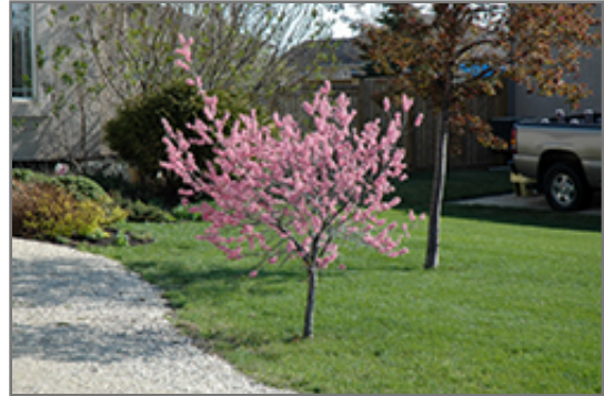
Muckle Plum in bloom

This shrub should only be grown in full sunlight. It does best in average to evenly moist conditions, but will not tolerate standing water. It is not particular as to soil type or pH. It is highly tolerant of urban pollution and will even thrive in inner city environments. This particular variety is an interspecific hybrid.