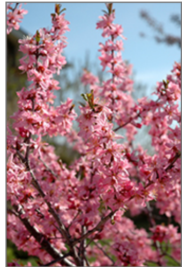
Muckle Plum flowers