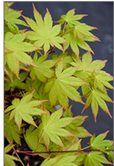
Summer Gold Japanese Maple foliage