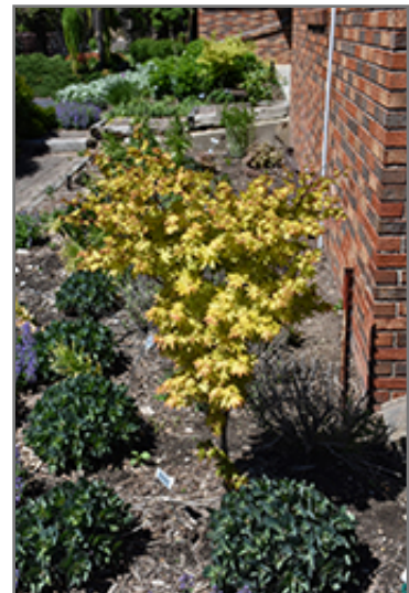
Summer Gold Japanese Maple