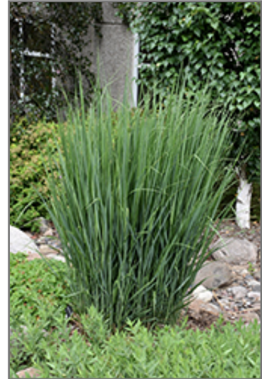
Northwind Switch Grass