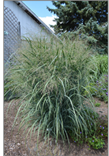
Northwind Switch Grass in bloom

This plant does best in full sun to partial shade. It is very adaptable to both dry and moist locations, and should do just fine under typical garden conditions. It is considered to be drought-tolerant, and thus makes an ideal choice for a low-water garden or xeriscape application. It is not particular as to soil type, but has a definite preference for alkaline soils, and is able to handle environmental salt. It is somewhat tolerant of urban pollution. This is a selection of a native North American species. It can be propagated by division; however, as a cultivated variety, be aware that it may be subject to certain restrictions or prohibitions on propagation.