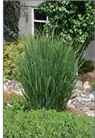
Northwind Switch Grass