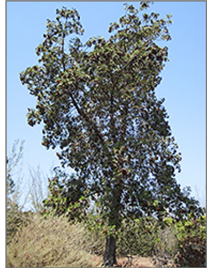
Santa Cruz Island Ironwood