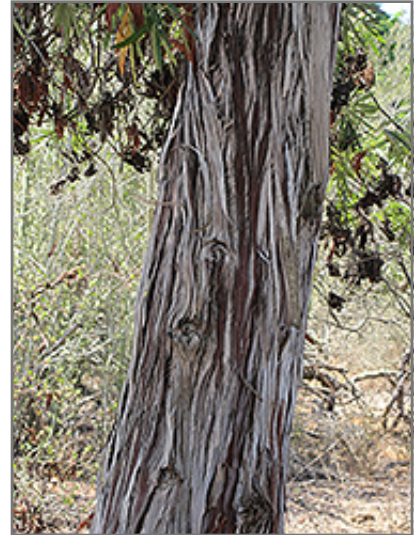
Santa Cruz Island Ironwood bark

This tree does best in full sun to partial shade. It prefers dry to average moisture levels with very well-drained soil, and will often die in standing water. It is considered to be drought-tolerant, and thus makes an ideal choice for xeriscaping or the moisture-conserving landscape. It is very fussy about its soil conditions and must have sandy, acidic soils to ensure success, and is subject to chlorosis (yellowing) of the foliage in alkaline soils, and is able to handle environmental salt. It is somewhat tolerant of urban pollution. This species is native to parts of North America.