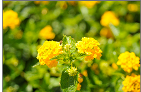
Landmark Gold Lantana flowers

Landmark Gold Lantana is recommended for the following landscape applications;