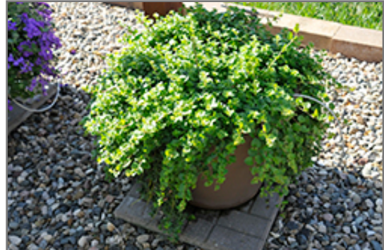
Indian Mint