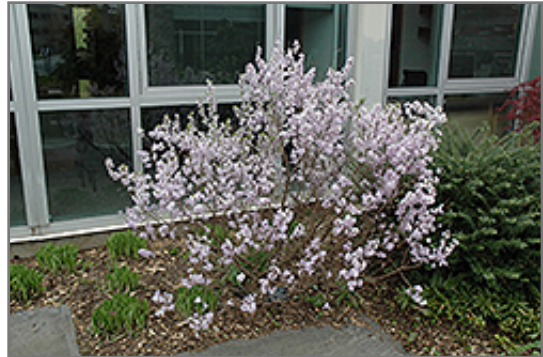
Hackenberry Lilac Daphne in bloom