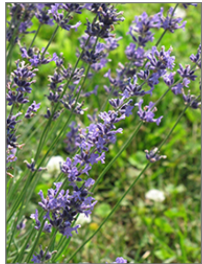
Purple Bouquet Lavender flowers