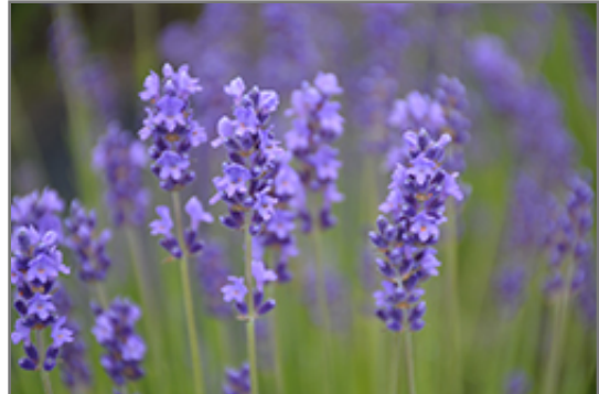
Purple Bouquet Lavender flowers

Purple Bouquet Lavender is a dense multi-stemmed evergreen shrub with a mounded form. It lends an extremely fine and delicate texture to the landscape composition which should be used to full effect.