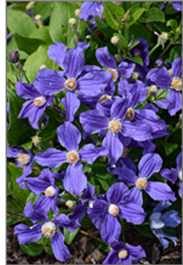
Rain Dance Clematis flowers