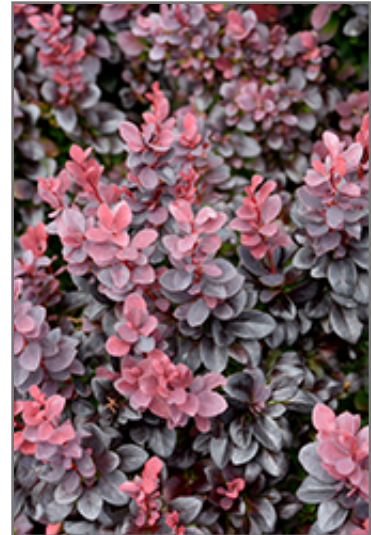
Concorde Japanese Barberry foliage