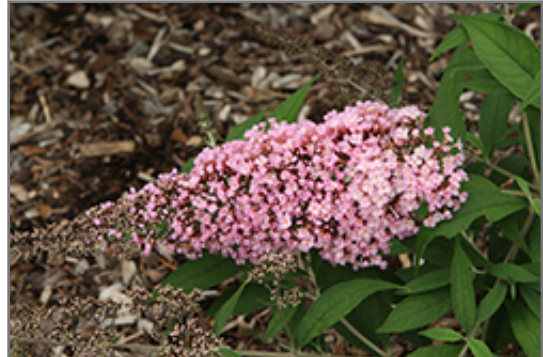
Pink Cascade II Butterfly Bush flowers

This is a relatively low maintenance shrub, and is best pruned in late winter once the threat of extreme cold has passed. It is a good choice for attracting bees, butterflies and hummingbirds to your yard, but is not particularly attractive to deer who tend to leave it alone in favor of tastier treats. It has no significant negative characteristics.