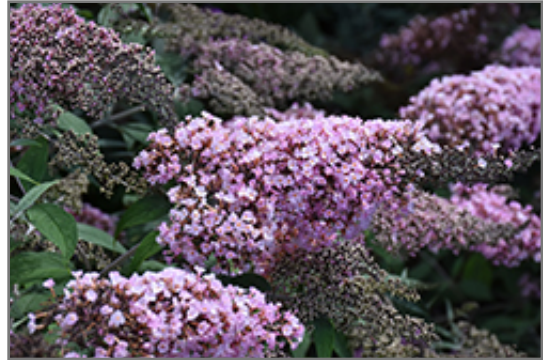
Pink Cascade II Butterfly Bush flowers

Pink Cascade II Butterfly Bush will grow to be about 4 feet tall at maturity, with a spread of 5 feet. It tends to be a little leggy, with a typical clearance of 1 foot from the ground. It grows at a fast rate, and under ideal conditions can be expected to live for approximately 20 years.