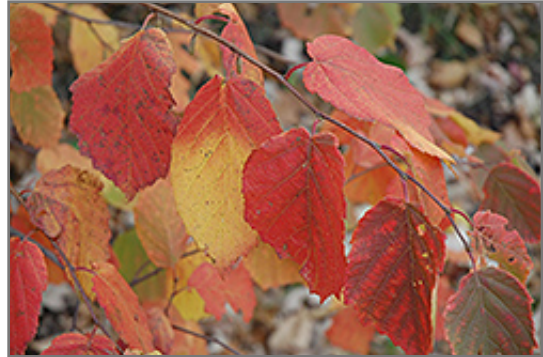
Beaked Hazelnut in fall