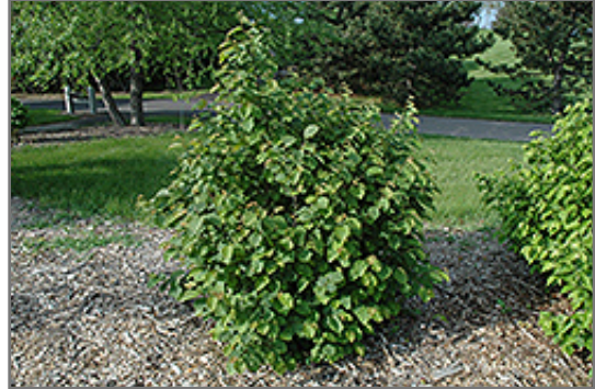
Beaked Hazelnut

Beaked Hazelnut will grow to be about 8 feet tall at maturity, with a spread of 7 feet. It tends to be a little leggy, with a typical clearance of 2 feet from the ground, and is suitable for planting under power lines. It grows at a medium rate, and under ideal conditions can be expected to live for approximately 30 years. While it is considered to be somewhat self-pollinating, it tends to set heavier quantities of fruit with a different variety of the same species growing nearby.