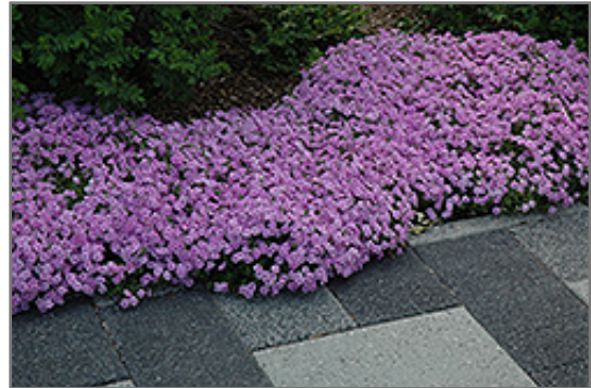
Fort Hill Moss Phlox in bloom