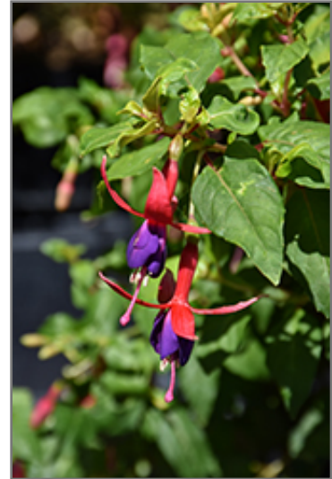
Golden Gate Hardy Fuchsia flowers

Golden Gate Hardy Fuchsia is recommended for the following landscape applications;