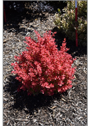
Sunjoy Neo Japanese Barberry

Sunjoy Neo Japanese Barberry makes a fine choice for the outdoor landscape, but it is also well-suited for use in outdoor pots and containers. It can be used either as 'filler' or as a 'thriller' in the 'spiller-thriller-filler' container combination, depending on the height and form of the other plants used in the container planting. It is even sizeable enough that it can be grown alone in a suitable container. Note that when grown in a container, it may not perform exactly as indicated on the tag - this is to be expected. Also note that when growing plants in outdoor containers and baskets, they may require more frequent waterings than they would in the yard or garden.