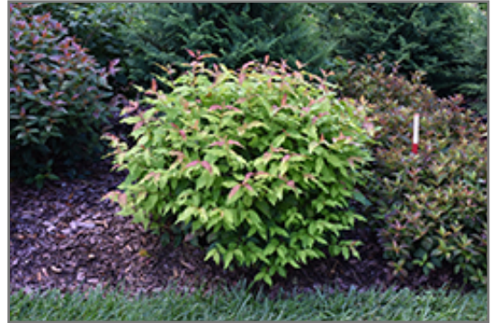
Kodiak Fresh Diervilla