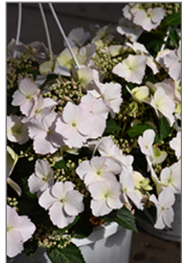
Fairytrail Bride Cascade Hydrangea flowers