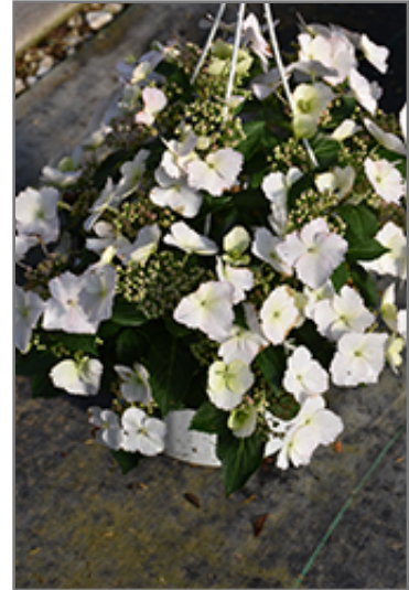
Fairytrail Bride Cascade Hydrangea flowers

Fairytrail Bride Cascade Hydrangea makes a fine choice for the outdoor landscape, but it is also well-suited for use in outdoor pots and containers. Because of its spreading habit of growth, it is ideally suited for use as a 'spiller' in the 'spiller-thriller-filler' container combination; plant it near the edges where it can spill gracefully over the pot. It is even sizeable enough that it can be grown alone in a suitable container. Note that when grown in a container, it may not perform exactly as indicated on the tag - this is to be expected. Also note that when growing plants in outdoor containers and baskets, they may require more frequent waterings than they would in the yard or garden.