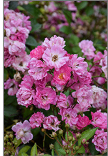
Pretty Polly Pink Rose flowers

Pretty Polly Pink Rose is recommended for the following landscape applications;