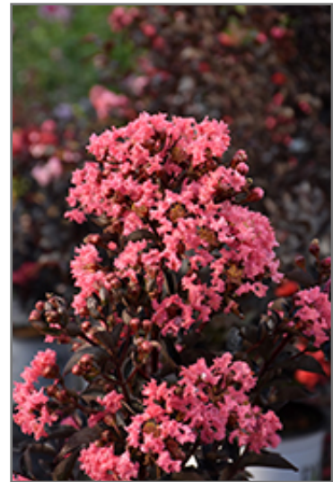
Center Stage Coral Crapemyrtle flowers

Center Stage Coral Crapemyrtle is recommended for the following landscape applications;