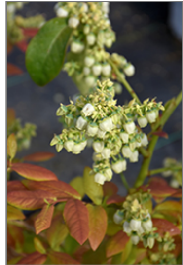
Sky Dew Gold Ornamental Blueberry flowers