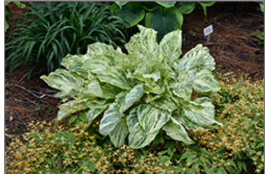
Emperor's New Clothes Hosta

Emperor's New Clothes Hosta is recommended for the following landscape applications;