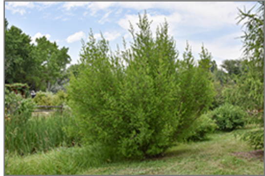
New Mexico Privet