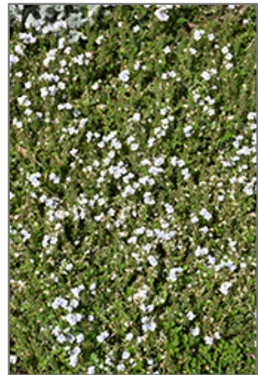
Snowmass Blue-Eyed Veronica in bloom