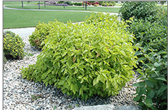
Prairie Fire Dogwood