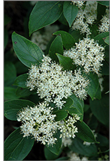
Snow Lace Dogwood flowers