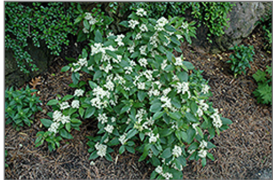
Snow Lace Dogwood in bloom