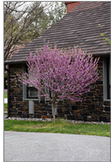
Kay's Early Hope Redbud in bloom