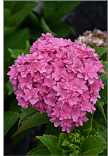
Starfield Hydrangea flowers