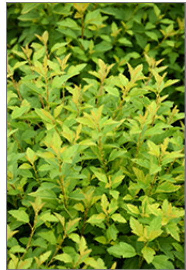
Raspberry Lemonade Ninebark foliage

Raspberry Lemonade Ninebark is recommended for the following landscape applications;