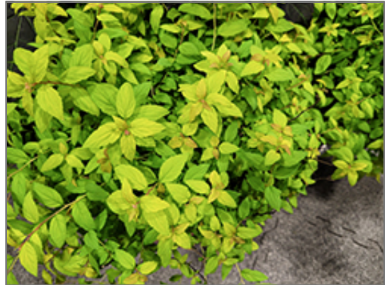
Little Spark Spirea foliage