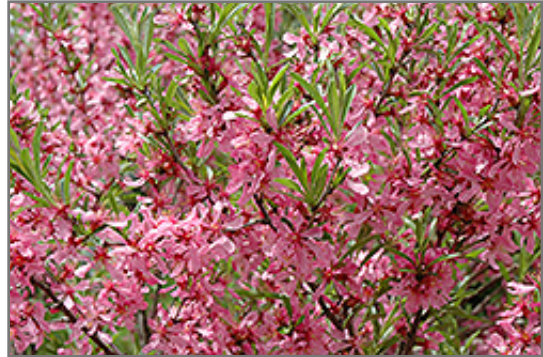
Russian Almond flowers