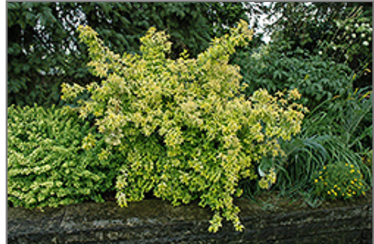
Gold Leaf Forsythia

Gold Leaf Forsythia is recommended for the following landscape applications;