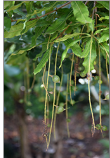
Beaumont Macadamia Nut fruit