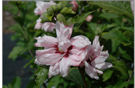
Blushing Bride Rose Of Sharon flowers

Blushing Bride Rose Of Sharon is recommended for the following landscape applications;