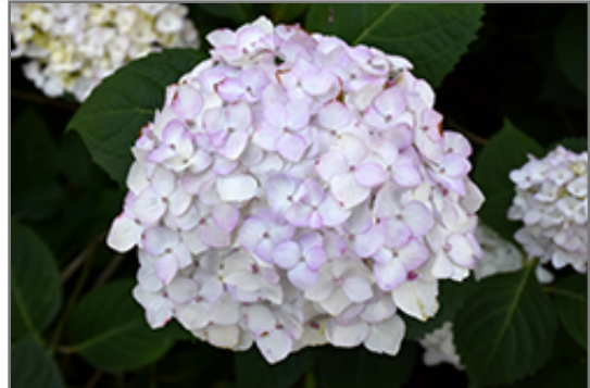
Blushing Bride Hydrangea flowers

Blushing Bride Hydrangea will grow to be about 4 feet tall at maturity, with a spread of 5 feet. It tends to be a little leggy, with a typical clearance of 1 foot from the ground. It grows at a medium rate, and under ideal conditions can be expected to live for approximately 20 years.